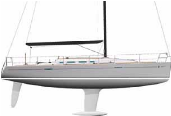
Deep draught keel - Cast iron / Lead (optional)