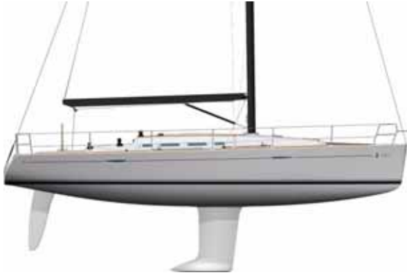
Deep draught keel - Cast iron - Standard