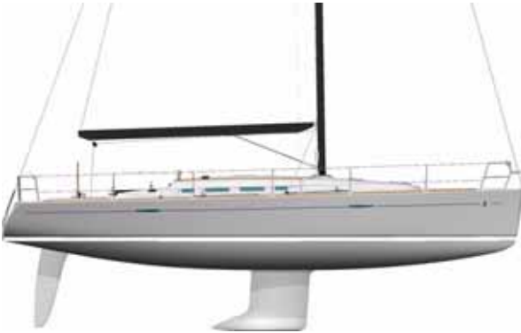
Shallow draught keel - Cast iron (optional)