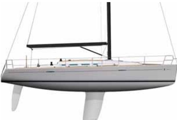
Deep draught keel - Lead (optional)