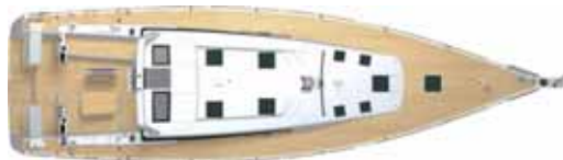
3 cabins - 3 wash rooms